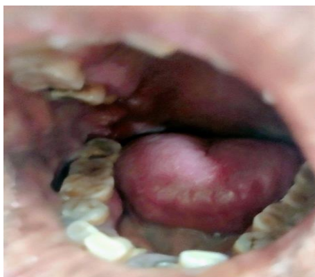
Fig.2. Ulceration above the right third molar region

She also complained of purulent discharge from the area of ulceration. Patient had history of Endometrial cancer with bone metastasis and patient is diagnosed as stage IV B of endometrial cancer on 22 nd January, 2017. Also with a history of radiotherapy. Patient is on monthly Infusion of Zoledronic 4mg since 23 rd January, 2017.