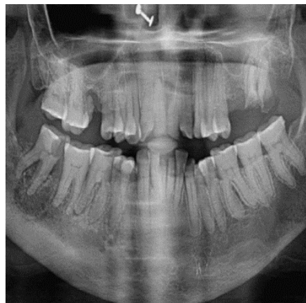
Fig.3. Necrosis at right third molar region

signs like buccal space infection and dental caries and suggested an Orthopantomogram (OPG) for further investigation. Orthopantomogram revealed necrosed lower jaw at right third molar region Fig. 3. Finally she was diagnosed as jaw osteonecrosis. Physician discontinued the Infusion Zoledronic acid 4mg.