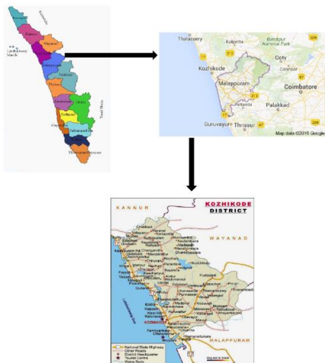
Fig. 1. Map showing Chengottumala Hills

arundinacea Linn., Mimosa pudica Linn., Plumeria alba Linn., Psidium guajava Linn., Scoparia dulcis Linn., Tamarindus indica Linn., Urena lobate Linn., and Vernonia cinerea Less (Table: 4). The presence of invasive species in the rangeland increase increases its biodiversity and species richness, it can decrease the health of the ecosystem (5 and 6). Document the geographic origin of the plant species bring out a valuable database, enable the better management and conservation of Chengottumala Hills.