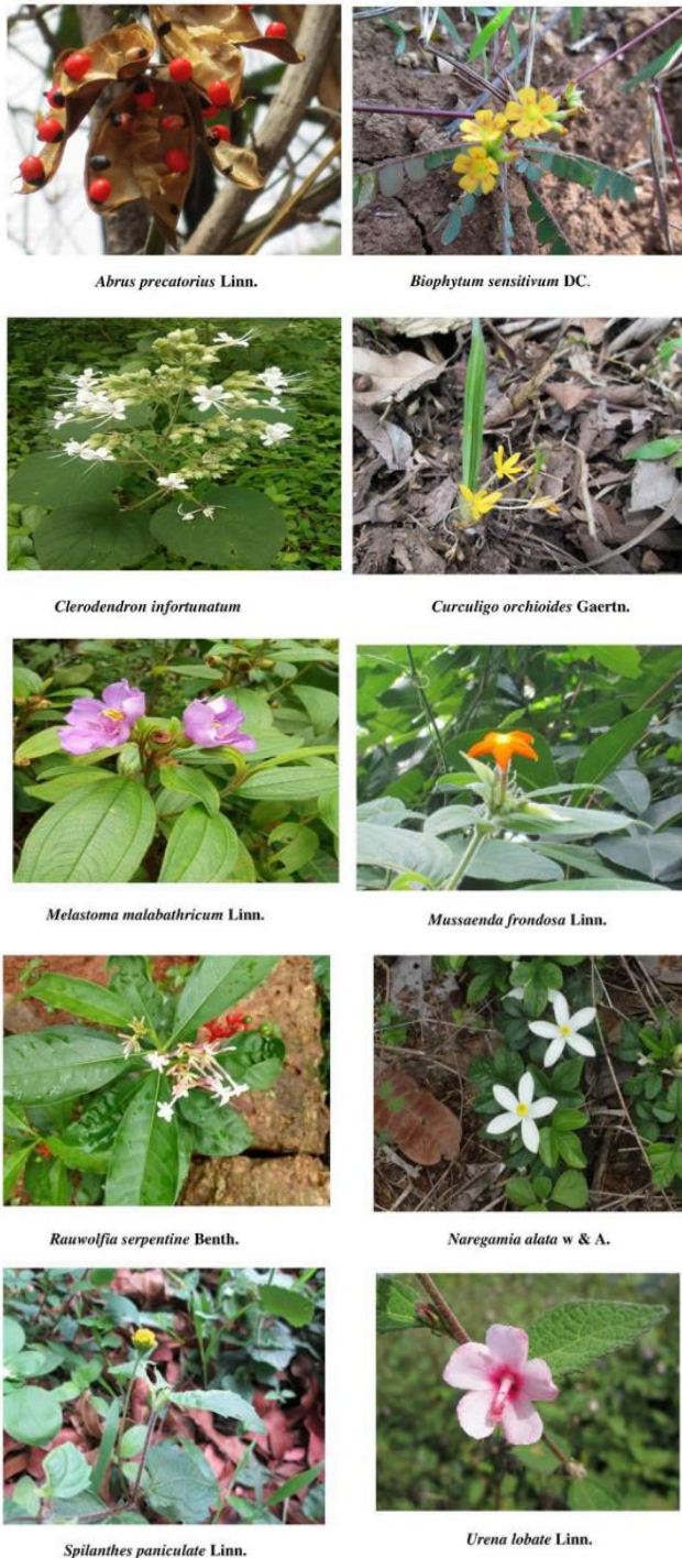
Fig. 4. Medicinal Plants in Chengottumala Hills